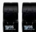
COD. 12/C Pair of photocells