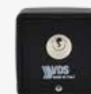
COD. 198/5 Key selector