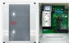
COD. E107 Control board 230V - 380V