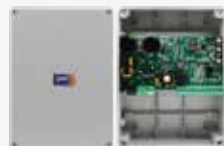
COD. Q100 Control board 230V Inverter